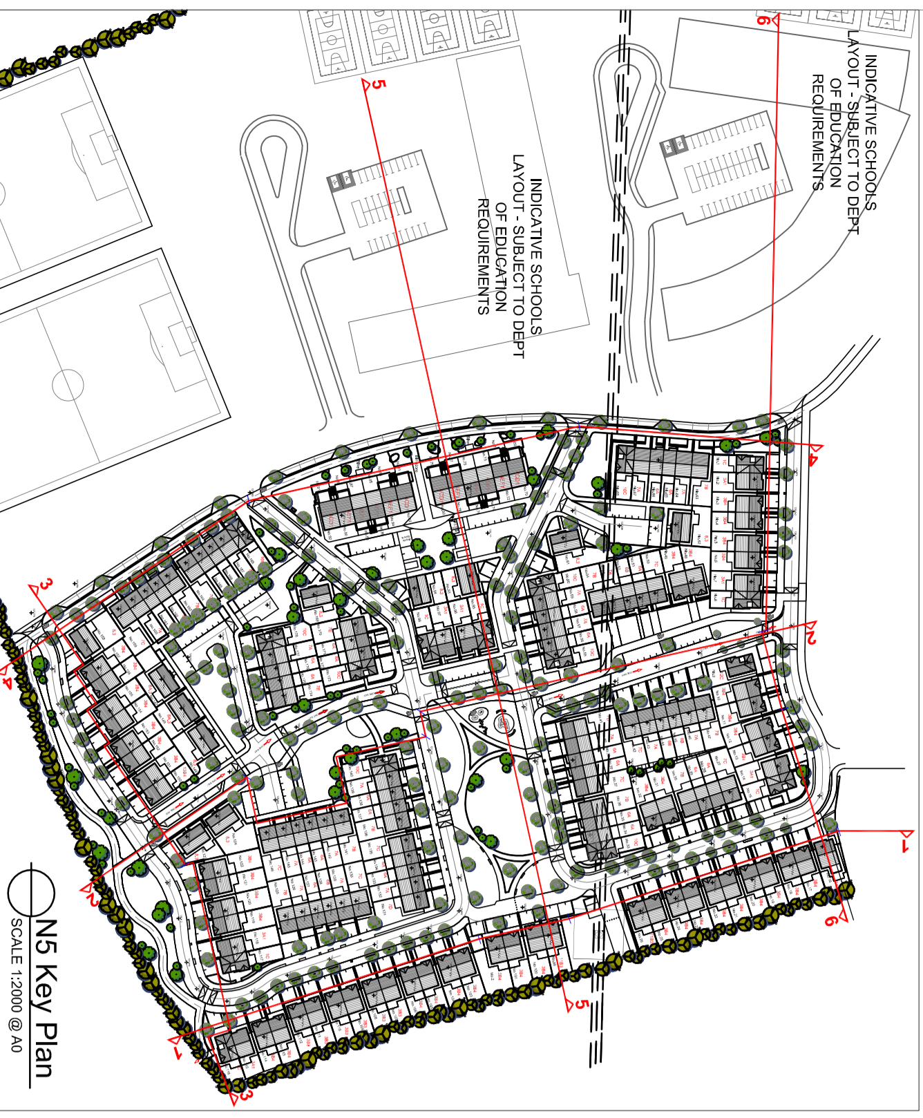
NS Key Plan SCALE: 1:300 @ A0