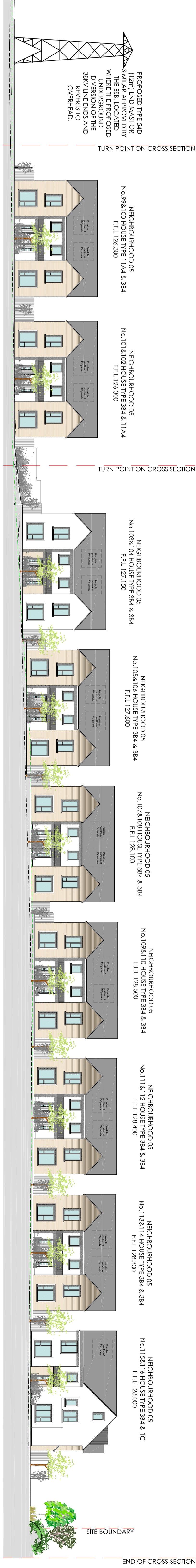
Section 1-1 Part 2 of 2 SCALE: 1:300 @ A0