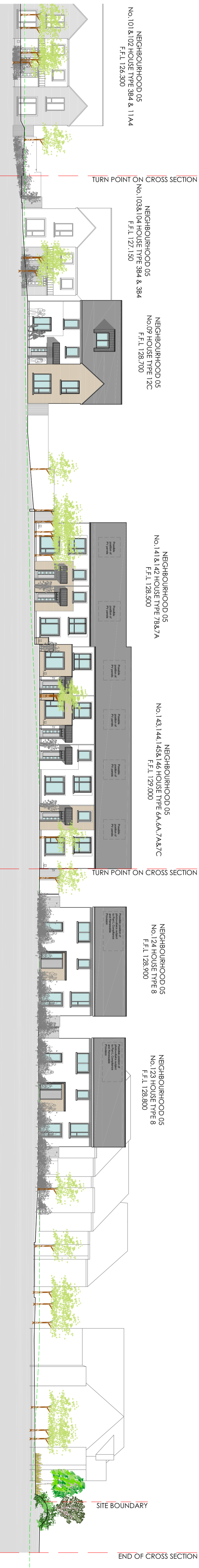
Section 2-2 Part 2 of 2 SCALE: 1:300 @ A0